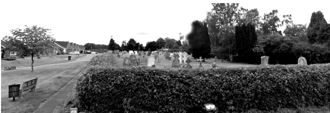
The Extended Churchyard on Richer Road